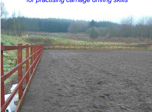
The Centre has a new 40 x 80m outdoor arena for practising carriage driving skills