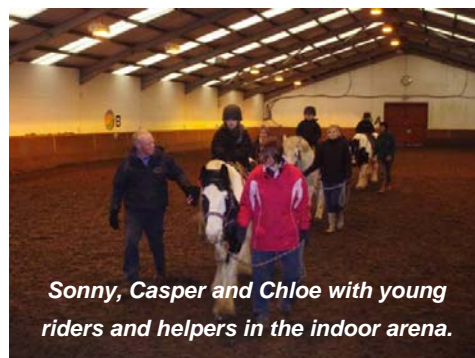
Sonny, Casper and Chloe with young riders and helpers in the indoor arena.