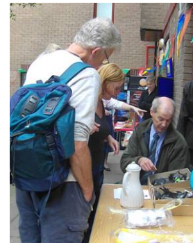
The Disability Awareness table was one of several displays.

More images of the day can be seen on the CVS Stirling website at www.cvs-stirling.org.uk/News.htm , and there will be a full report of the event in the September issue of SAAP News, due out at the end of the month.