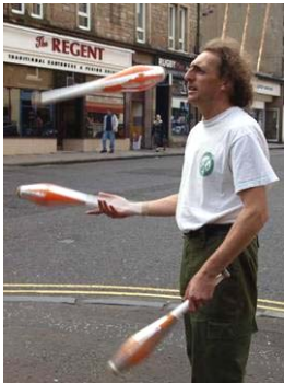
.. the juggler enthralled us with his skills (and patter).

Thanks to all the groups who participated – and to the enquiring members of the public who came along – SAAP's launch turned out to be a memorable occasion.